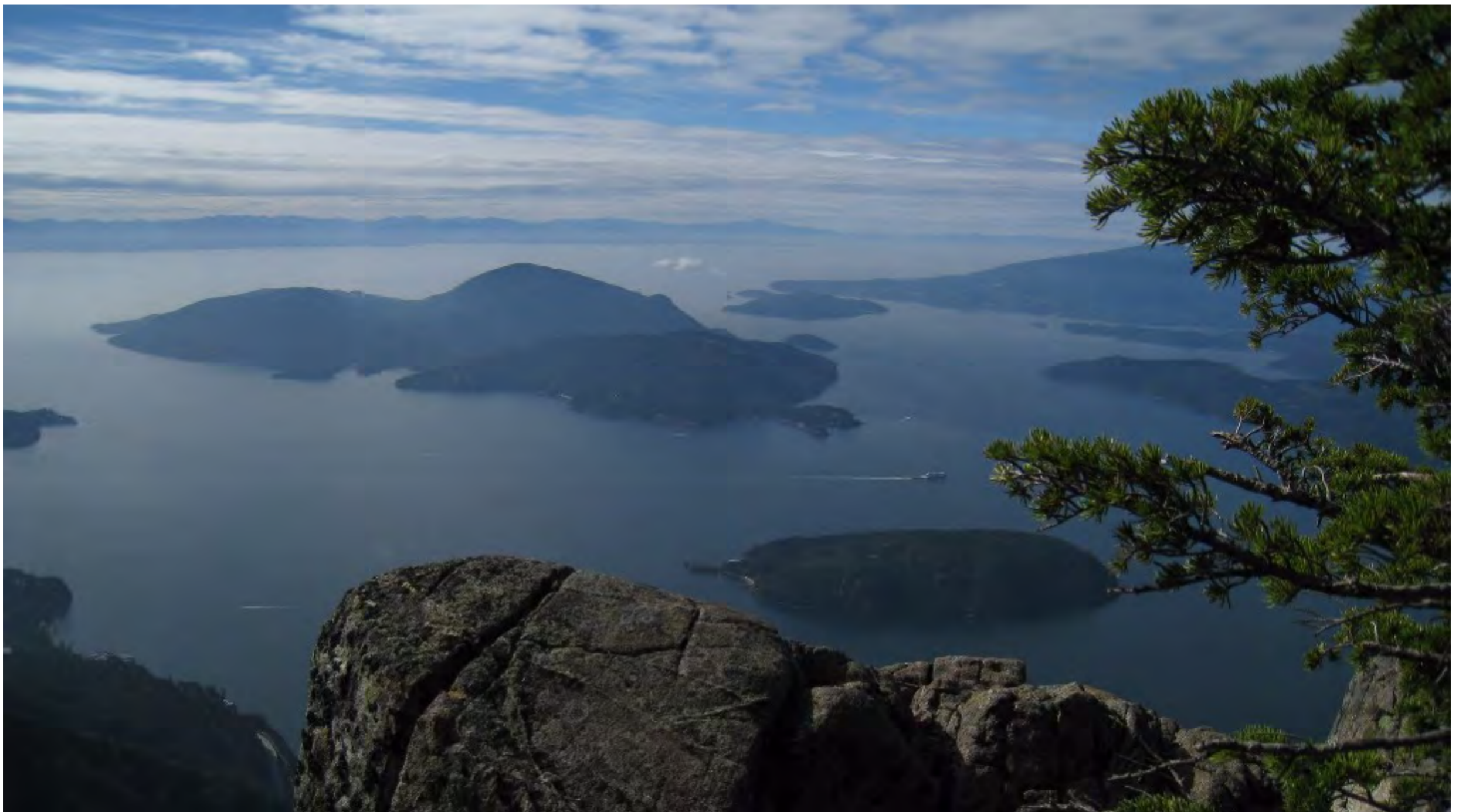
View of Bowen from St. Mark's Summit.

We are excited to share our news with you and to highlight how the generous support of our donors and contributors has benefitted the community of Bowen Island. If you have questions, comments, or ideas for our next newsletter, we invite you to get in touch with us!