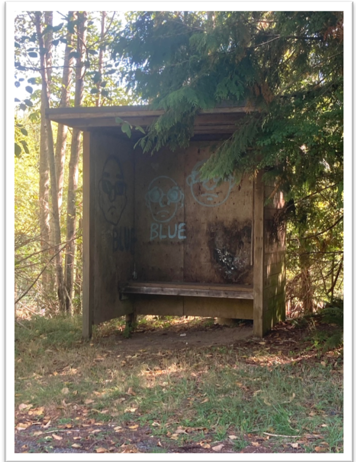
The original bus shelter at Bishop's Hill