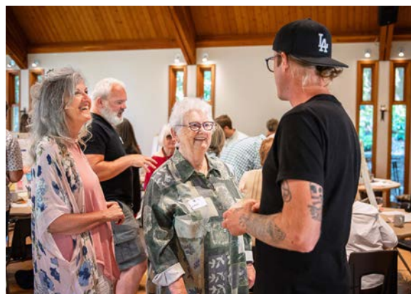
Vital Conversations event at Cates Hill Chapel, June 3, 2023

Many people participated in the research and preparation for the initiative, and over fifty people attended an in-person event this past June in which priorities were identified and imagined futures discussed. The resulting report not only identifies gaps, but also helps us