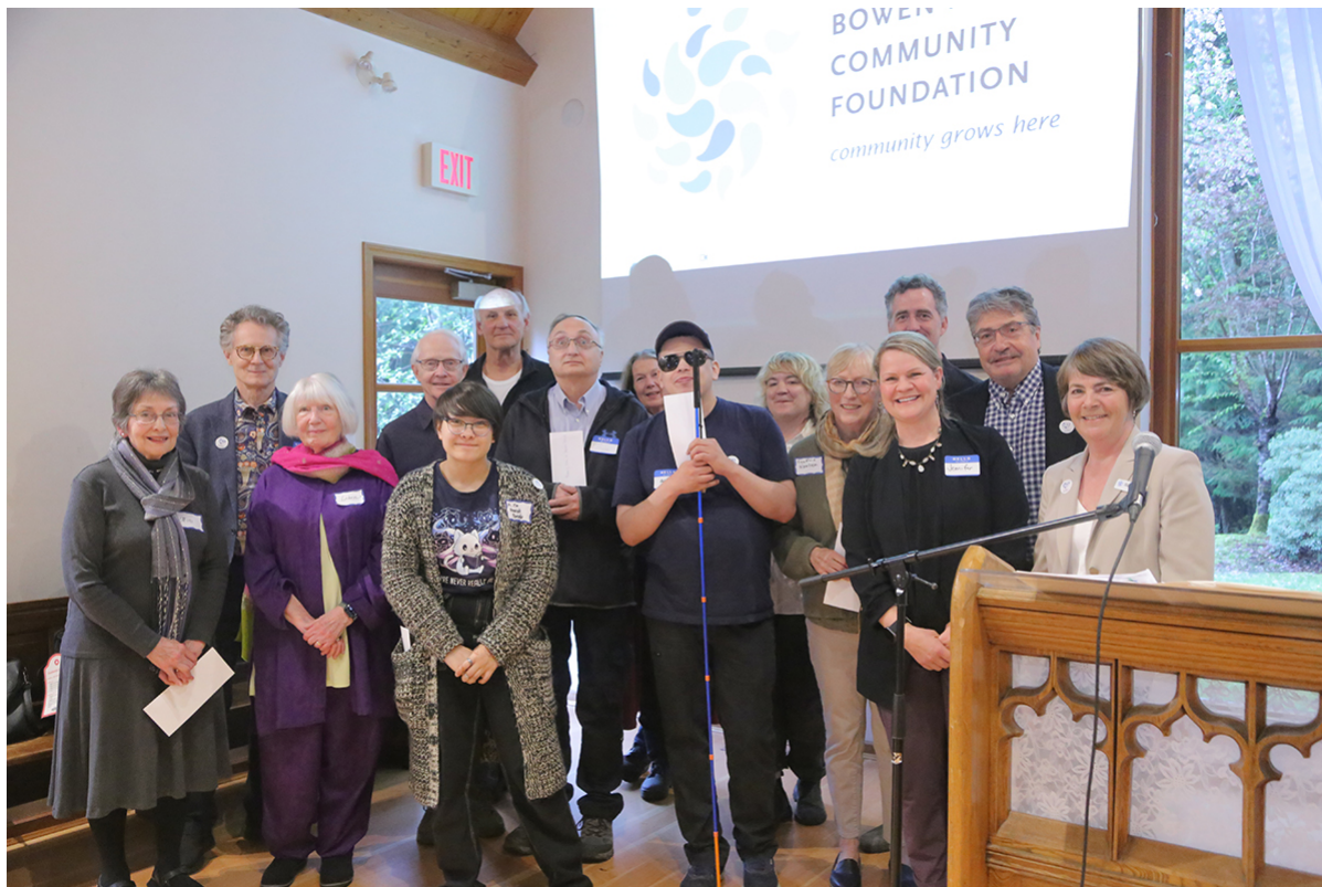
Community Impact Grant recipients were celebrated (and cheques handed out!) at the Foundation annual meeting.

The Foundation dispersed $60,000 in Community Impact Grants to the following projects, which all promise to enrich community life on this island we all share: Bowen Island Community Centre, furniture for the Community Living Room ($9,500); the Green Man Festival, a youth-led project to reinstate the festival ($2,500); Bowen Island United Church, improvements to Collins Hall ($17,000); Rotary Club, greenhouse at Grafton Gardens Common ($8,000); Bowen Health Centre, audio-visual equipment to assist delivery of healthcare, patient education, and staff training ($10,000); SKY (Seniors Keeping Young), rental of accessible vehicle for off-island excursions ($7,000); Bowen Birth Collective, funding for outreach work and to provide access to resources ($3,500); and the Bowen Island Museum and Archives, exhibit by the blind for the sighted, A New Way of Seeing ($2,500).